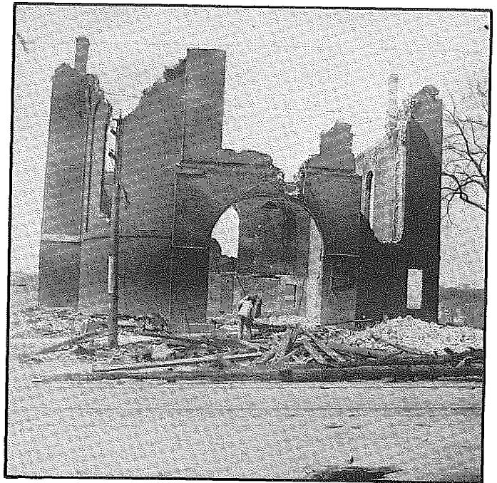
The First Parish Congregational Church after the 1911 fire.