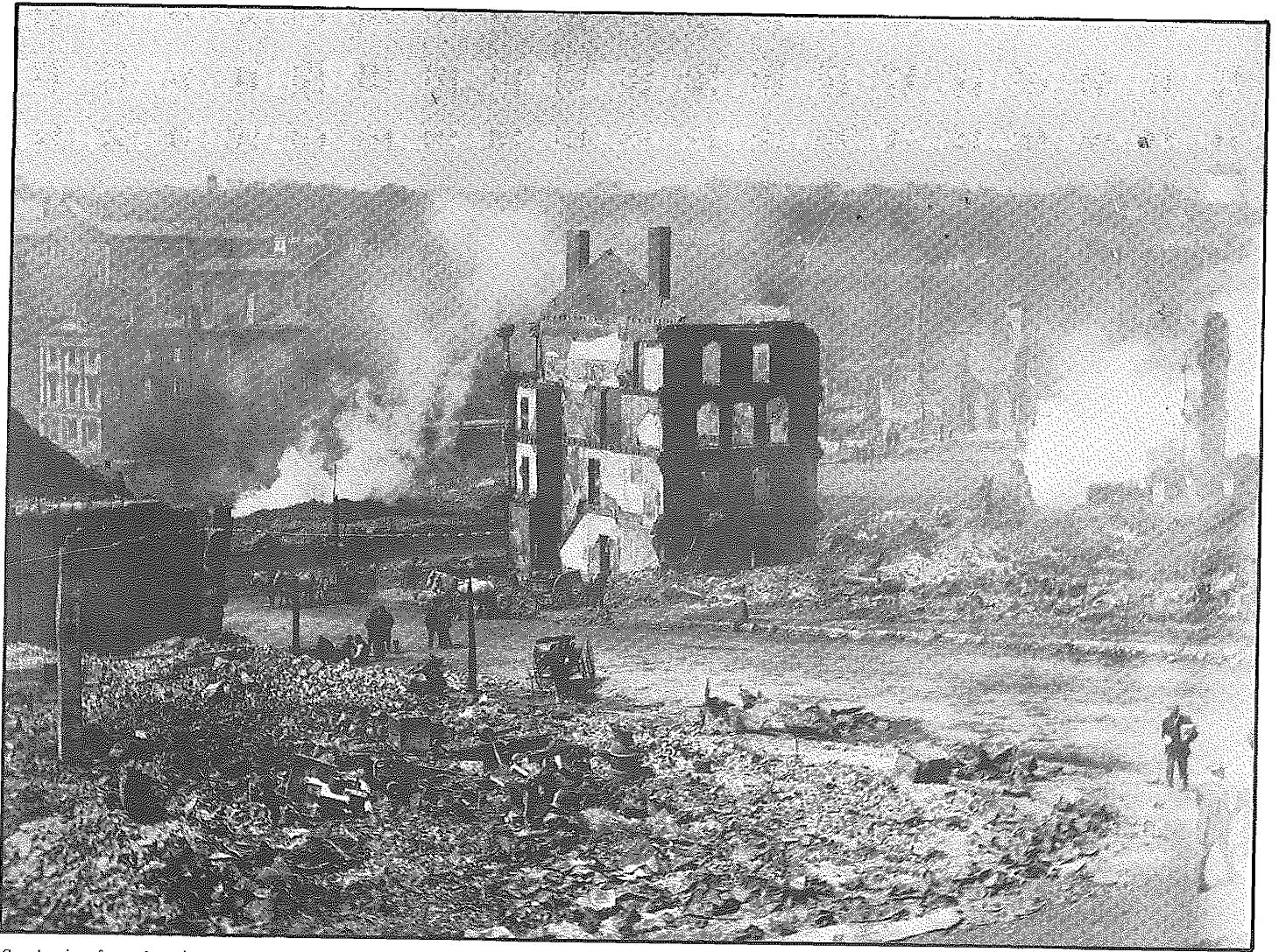
Smoke rises from the ruins at the corner of Park and State streets after the Bangor fire in 1911.