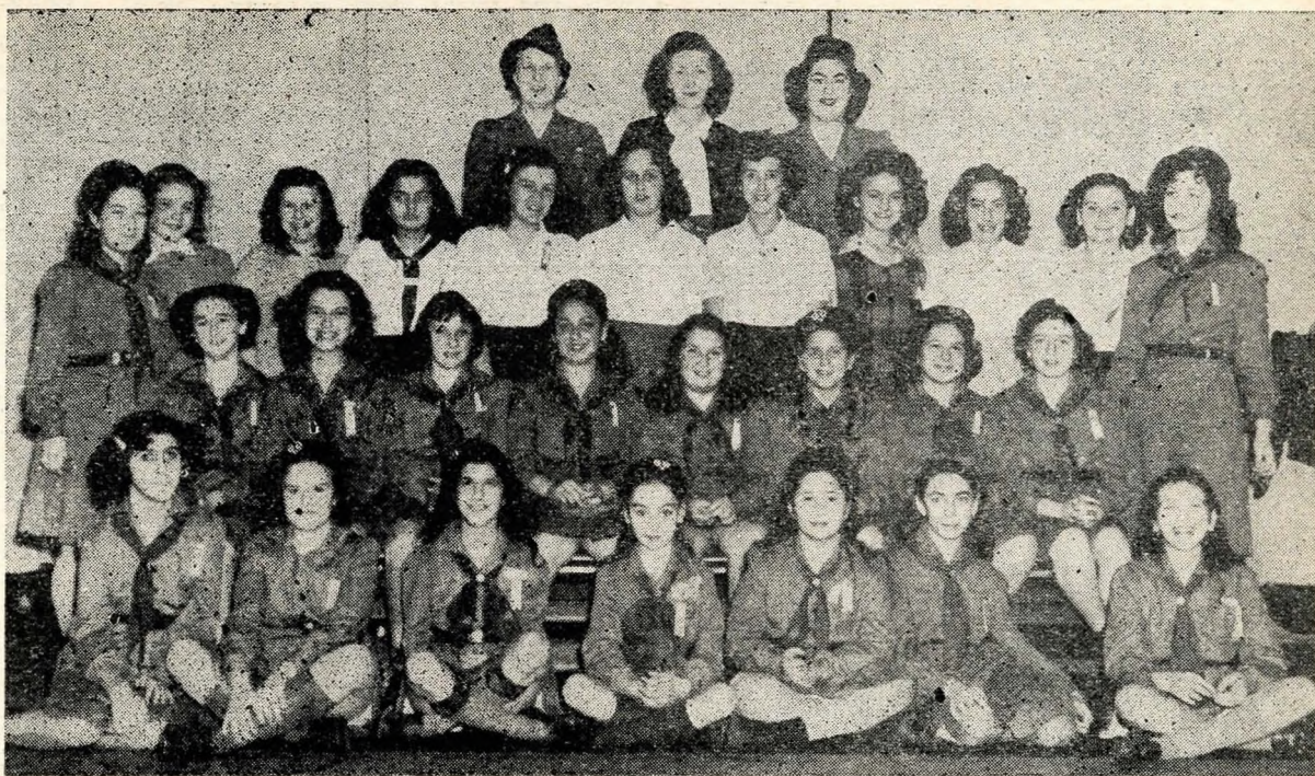
GIRL SCOUTS IN PICTURE ABOVE