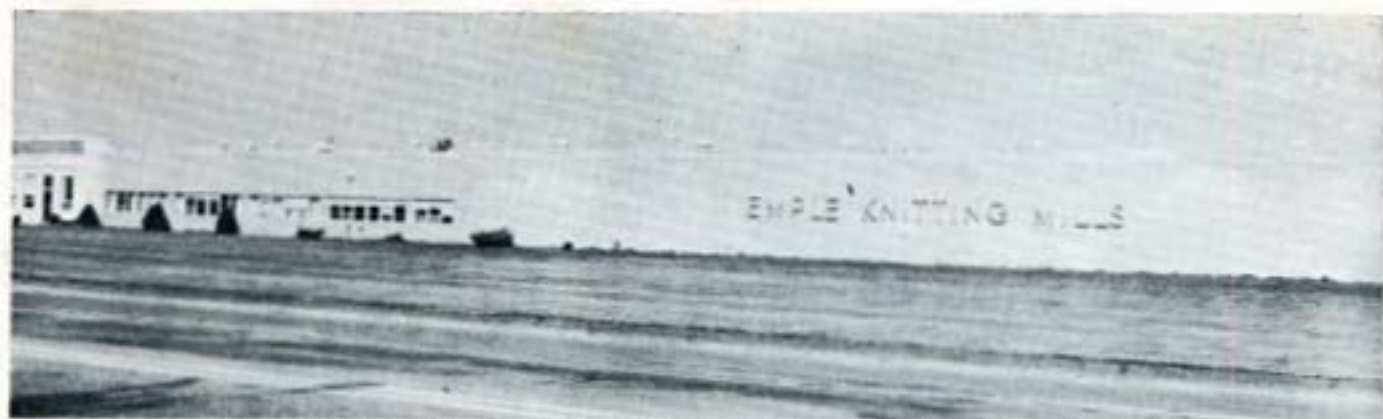
View of the 60,000 square foot Emple Knitting Mills plant on the outskirts of Brewer, Maine.