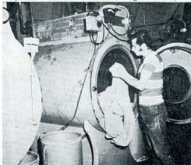
All knitted fabrics produced here are washed to take cut initial shrinkage, eliminate oil content and improve the hand of the end product.