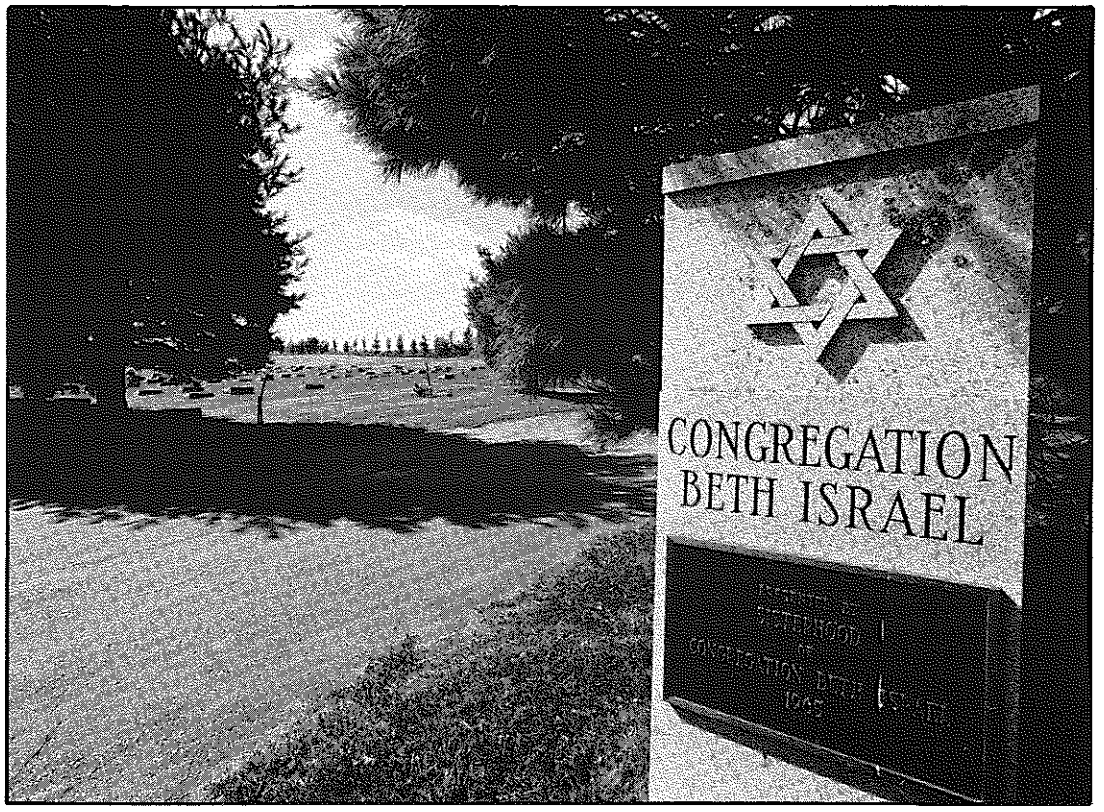
One of the entrances to the new section of the Beth Israel cemetery.

Life without the rituals of his religion was bearable for a Jew, but burial in unsanctified soil was not to be thought of. Hence it was that in this community as in many other communities, before a synagogue - before any other community project — a Jewish cemetery was the first step toward religious identity. Our founders, faced with the choice of burying their dead in a non-Jewish cemetery, decided in a positive Jewish spirit to seek ground which could be called Jewish