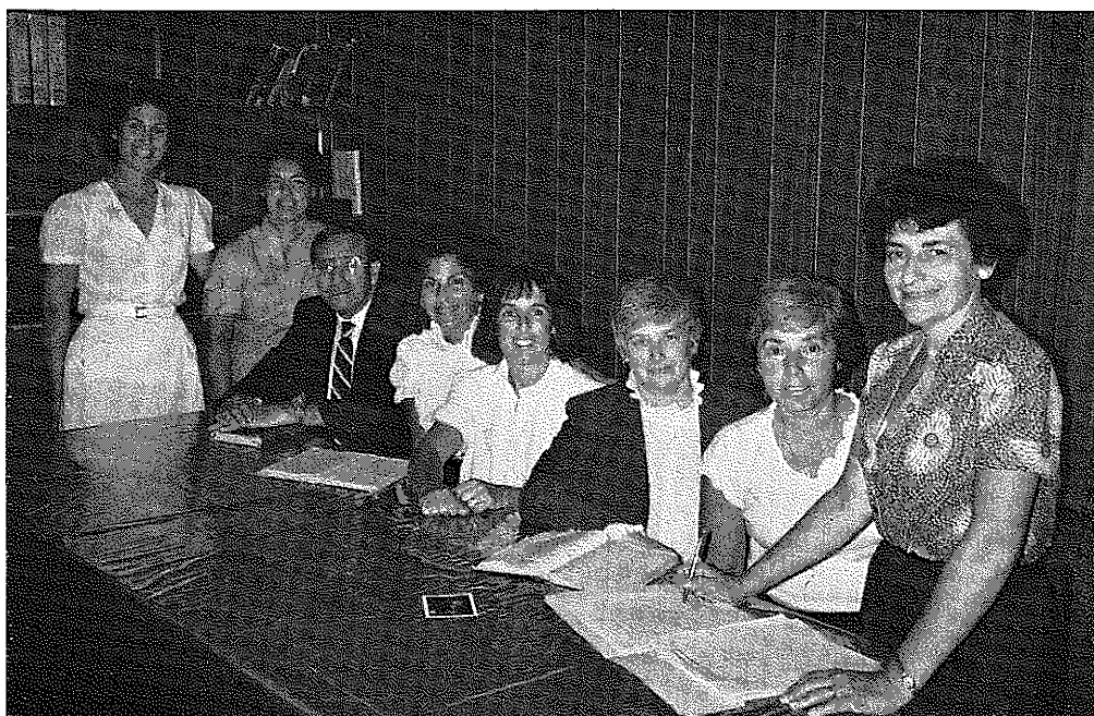
The Journal Committee