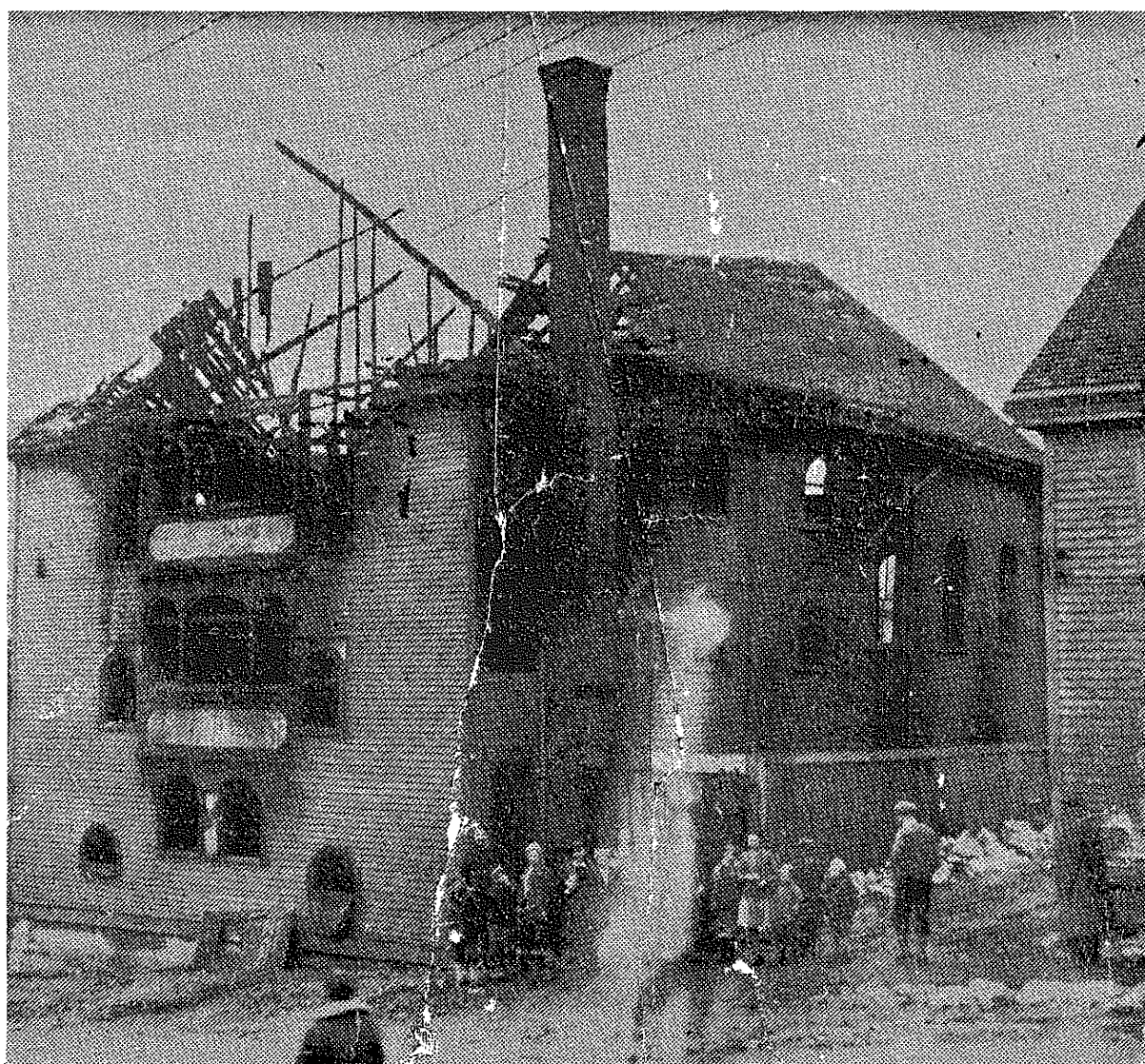
BETH ABRAHAM SYNAGOGUE Aftermath of the disastrous fire on Carr Street, March 30, 1932.