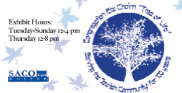
Exhibit Hours: Tuesday-Sunday 12-4 pm Thursday 12-8 pm