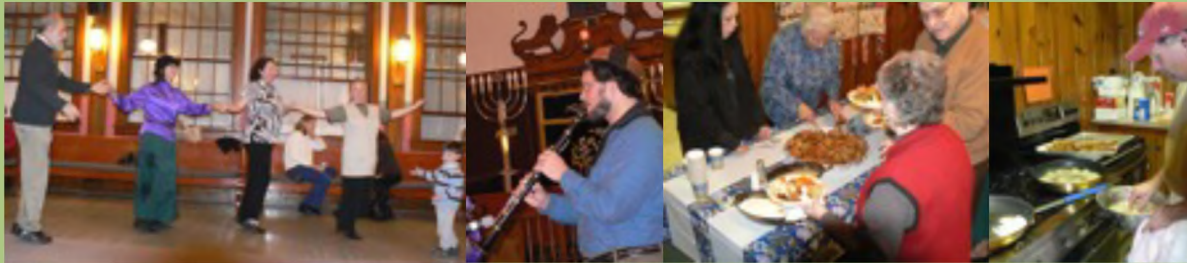
Chanukah Party at Congregation Etz Chaim: December 2007/Kislev 5768: Dancing, Swinging, Serving, Frying