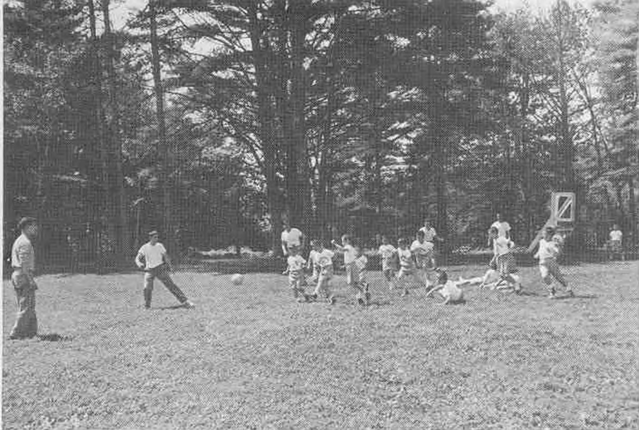
FRESHMAN SOCCER GAME