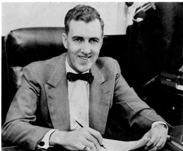
Edmund S. Muskie U. S. Senator

I welcome this opportunity to extend congratulations and best wishes to the Jewish Community of Portland on the 25th Anniversary of the Jewish Community Center.