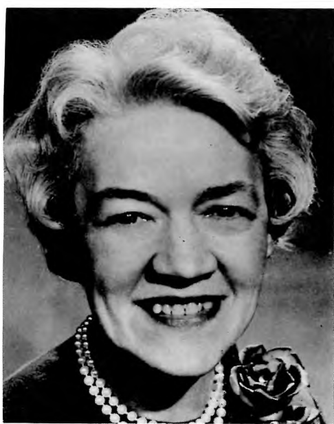
Margaret Chase Smith U. S. Senator

I wish to send my greetings to all members of the Jewish Faith on the occasion of their New Year and best wishes and congratulations to the Jewish Community Center on its 25th anniversary.