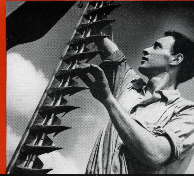
young glike. linked in freedom.