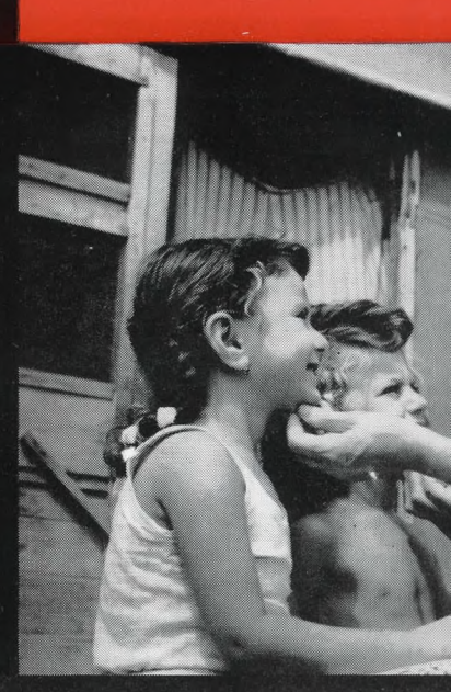
lsrael's greatest resource — humanit