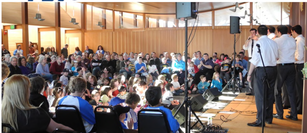
The Much-Anticipated Yeshiva University Maccabeats Concert at Bet Ha'am on April 29