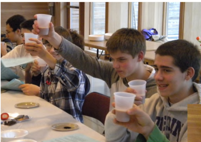
Evening Religious School's Chocolate Seder

An Oneg Shavuot will follow the service.