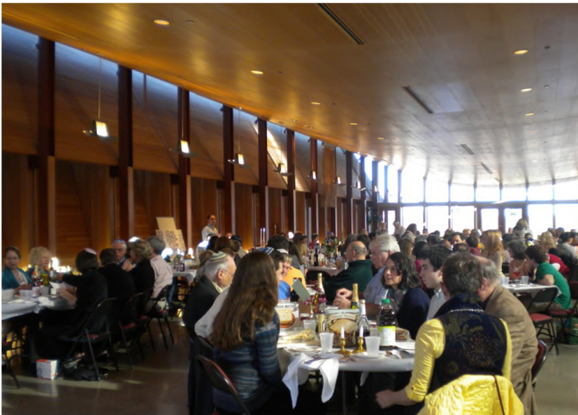
Bet Ha'am community seder