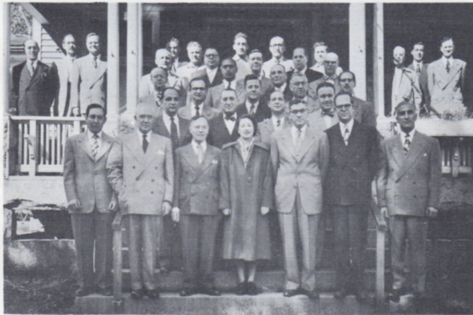
BOARD OF DIRECTORS, TEMPLE BETH EL — 1950-1951

and spiritually, can live among our fellow men honorably and with befitting dignity.