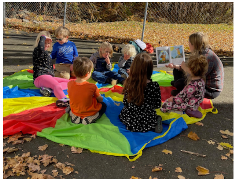
Pre Hebrew School class enjoys a story on a lovely fall day.