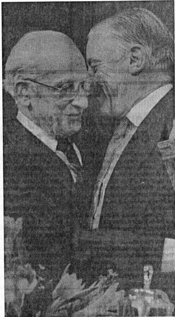
Shirley Povich, left, who has been writing about sports for The Washington Post since the '20s, receives a hug and a plaque from Ben Bradlee, the newspaper's vice president at-large, during the Anti-Defamation League dinner at the Willard Inter-Continental Hotel. Povich, 89, who started as a copyboy in 1922 for $12 a week, was honored with a lifetime achievement award by the league.