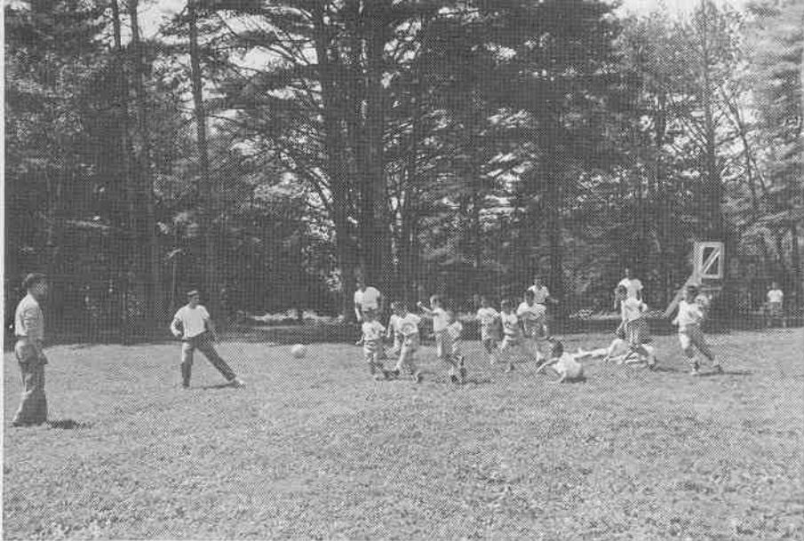
FRESHMAN SOCCER GAME